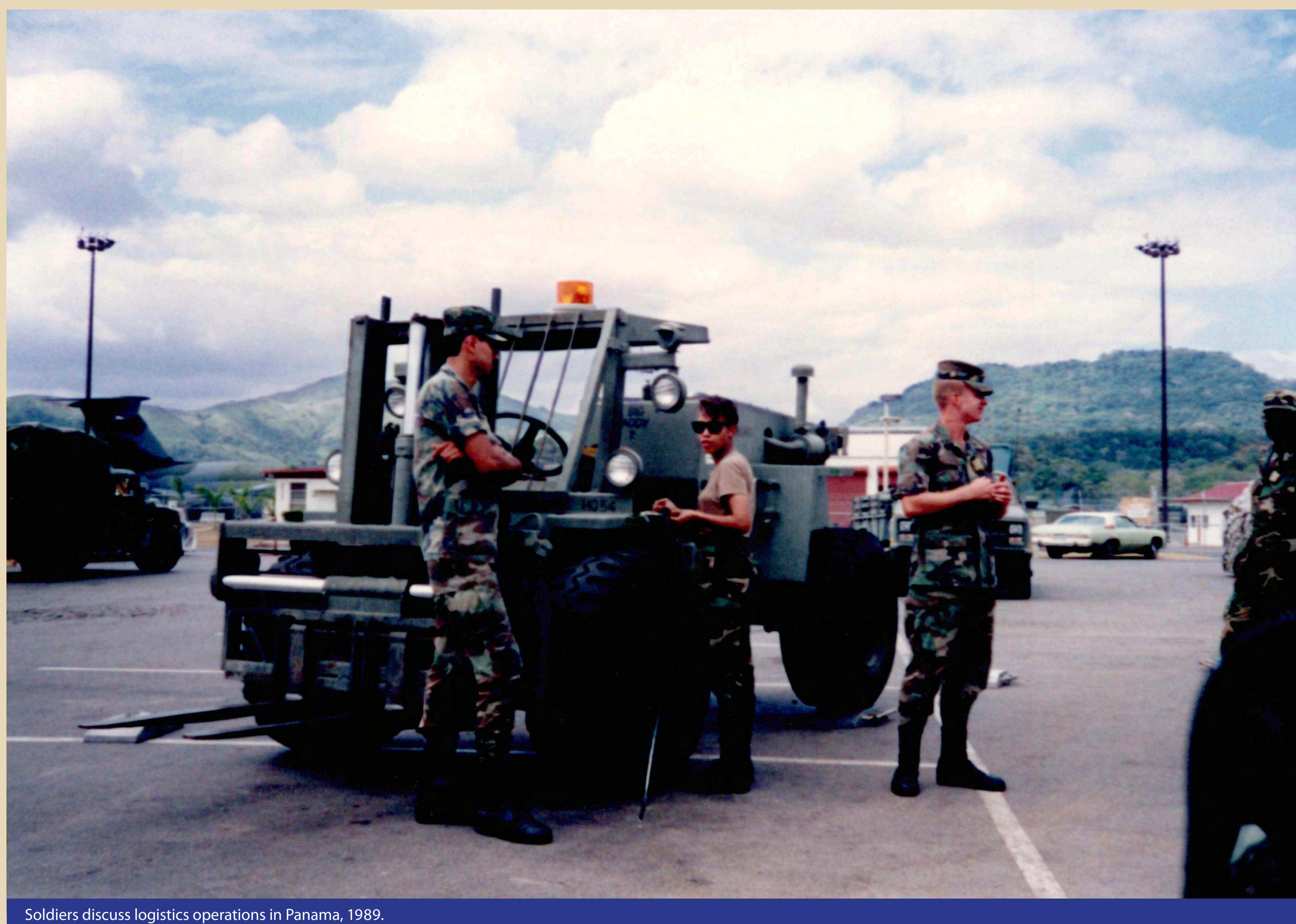
Soldiers discuss logistics operations in Panama, 1989.