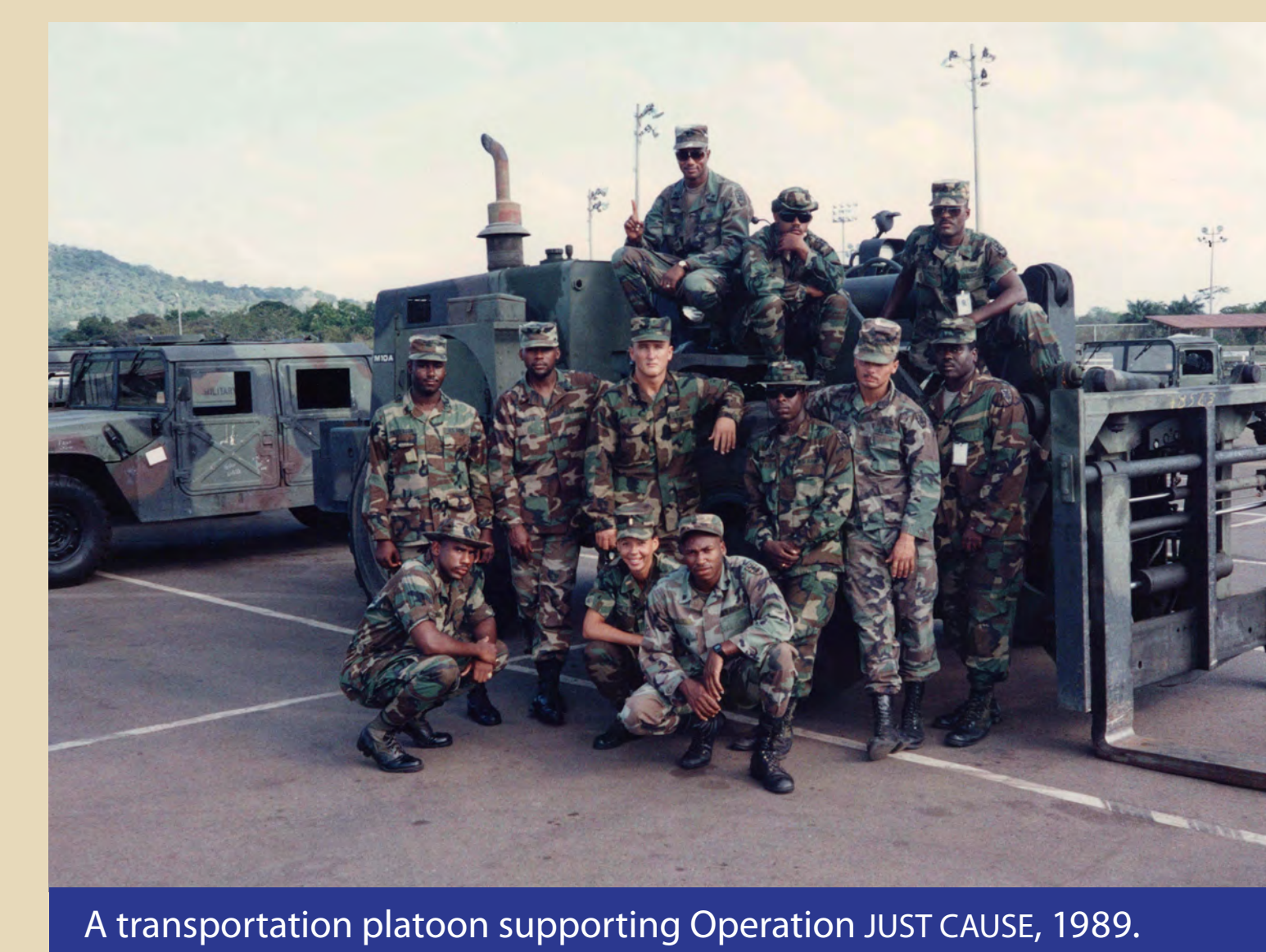
A transportation platoon supporting Operation JUST CAUSE, 1989.